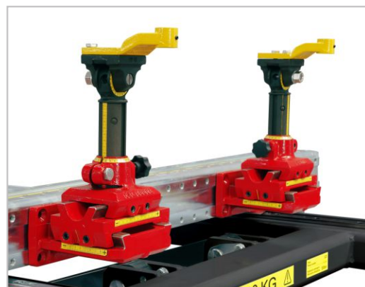
Universal Jig System