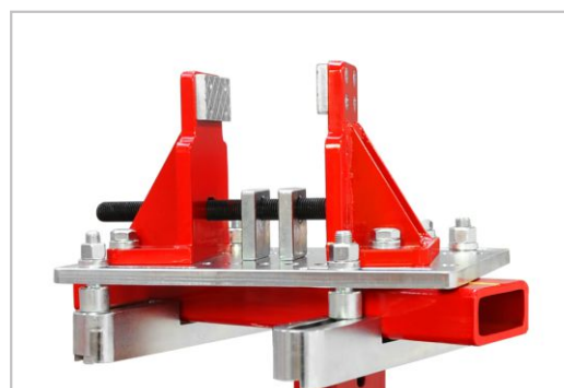
No.4 Truck and SUV sill clamps