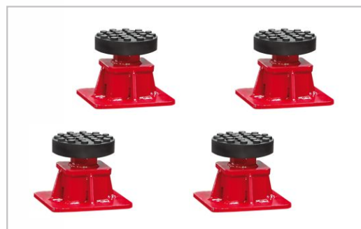
No.4 Holding pads