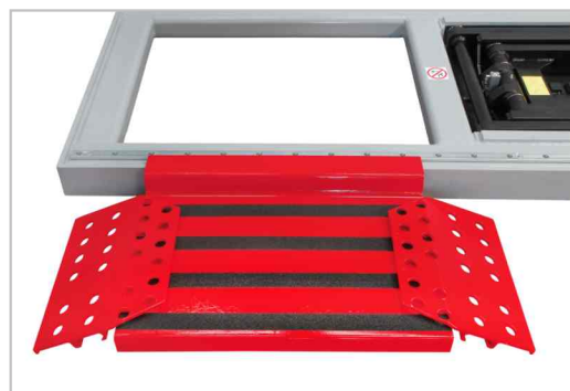
Wheel stop kit