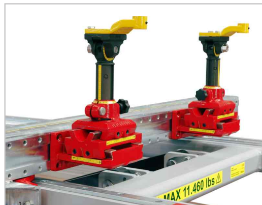
Universal Jig System