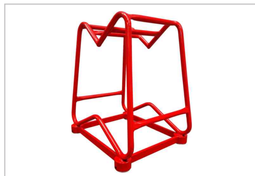
n. 4 Mobile stands