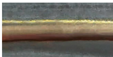
Brazing with CuSi 3 wire