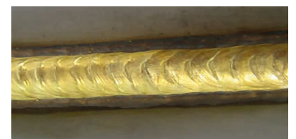
Brazing with CuAl 8 wire